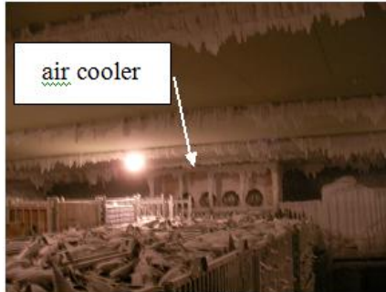
Existing ultra-low temperature refrigerator