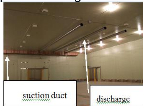
“Pascal Air” ultra-low temperature refrigerator