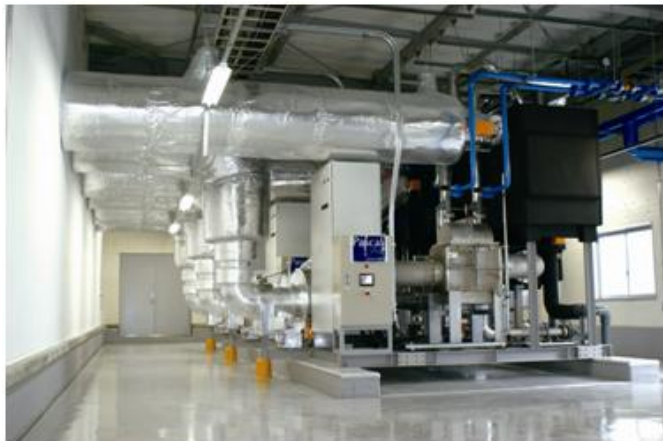
Installation of Pascal Air